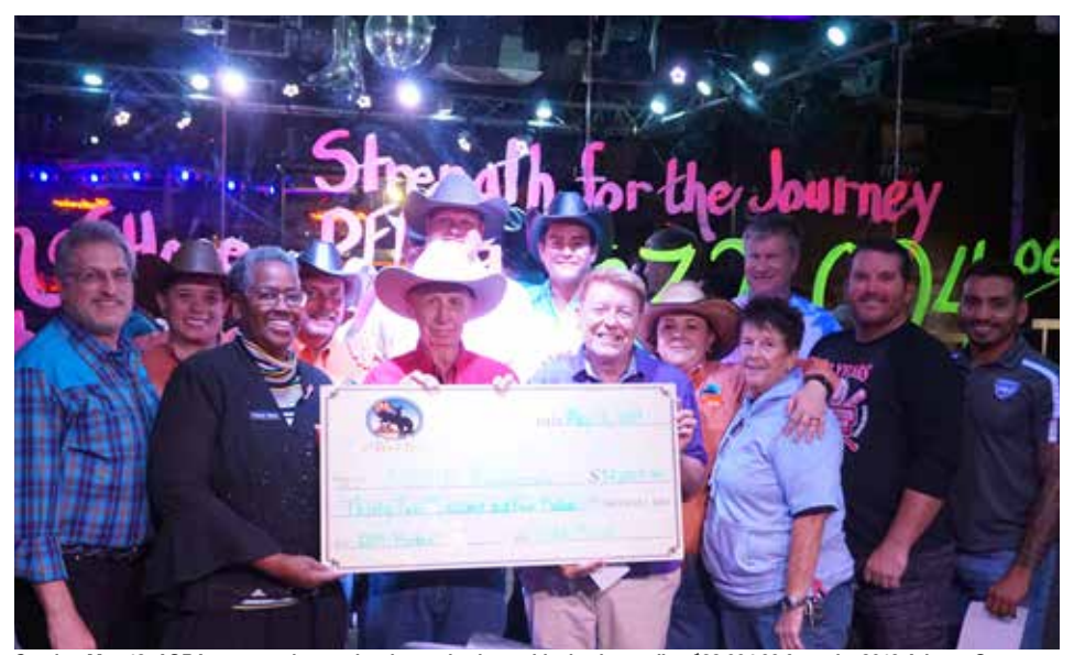
Sunday, May 12, AGRA presented seven local organizations with checks totaling $32,004.00 from the 2019 Arizona Gay Rodeo. See Rodeo Director's Report for more information.

Phone: (602) 510-9671 E-Mail: rtrusley@cox.net